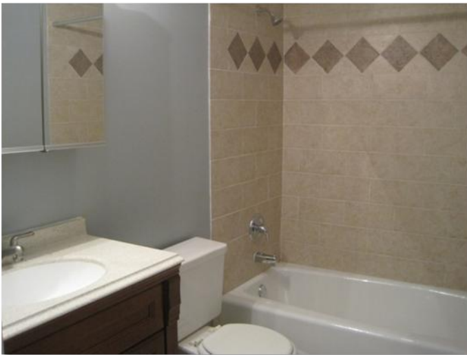
Bathroom (Tile maybe slightly different)