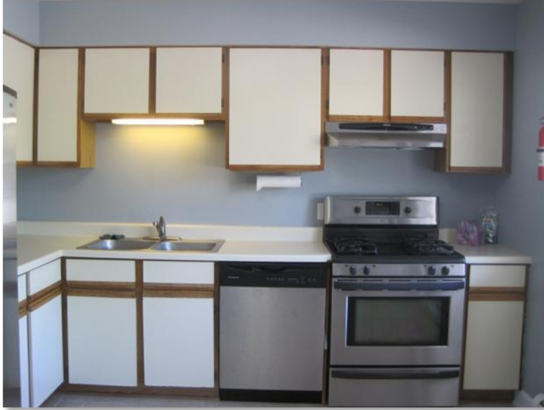
Kitchen. Note Appliances may be white